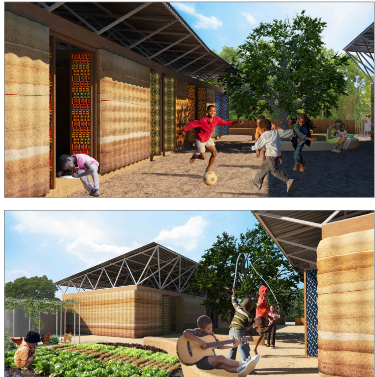
Figure 5. The proposal of Weave (Senegal Elementary School project) suggests fabric-formed rammed earth technology to empower a local community by involving them in the construction process, to build a water-resistant earthen structure, and to demonstrate the aesthetic feature of low technology.

will reduce dependency on imported expertise, resources, and labour, but increase opportunities for local people to use their skills, knowledge and power. Empowerment is an important element in the creation of sustainable and climate-resilient dwellings, but it is what most humanitarian shelter programmes lack.