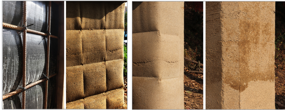
Figure 7. The arrangement of shuttering affects the shapes of fabric-formed rammed earth.