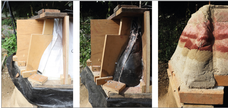
Figure 6. The fabric lends its quality and texture to the rammed earth, transforming the monolithic structure into a fabric-like texture and contour.

brickwork and carpentry that require highly skilled workers, fabric-formed rammed earth can be built by unskilled laborers and one skilled one.