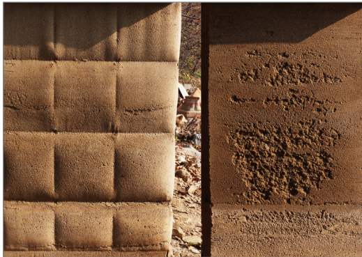
Figure 3. Both the FR and TR walls were produced with the same unstabilised earthen mixture. The FR wall had a smooth, fine surface (left), but the TR wall had a patchy surface (right).