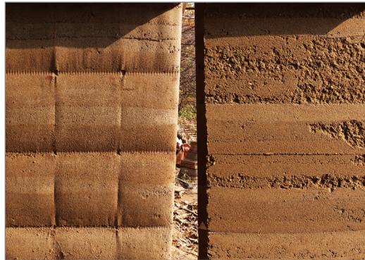
Figure 4. Both the FR and TR walls were built layer by layer with an unstabilised earthen mixture and a lime-stabilised earthen mixture. The patchy surface of the TR wall is clearly shown at the unstabilised earthen layer.

smooth, fine surface of the fabric-formed rammed earth and enabled it to dry quickly, unlike the rigid-formed rammed earth, which had a patchy surface (see Figure 3). This was more severe for the unstabilised earthen layer than the lime-stabilised layer (see Figure 4). These results show that moisture and air trapped in the impermeable rigid formwork affect the surface of an unstabilised rammed earth wall. Importantly, it is estimated that the patchy surface of the TR walls will be more eroded by rainfall because it is not densely compacted and smoothed. The low compaction is possibly due to the friction between the rigid formwork and the rammer (Bui et al., 2009). The change in the performance and surface of both the FR and TR test walls will be carefully observed and recorded to detect any erosion in the forthcoming years.