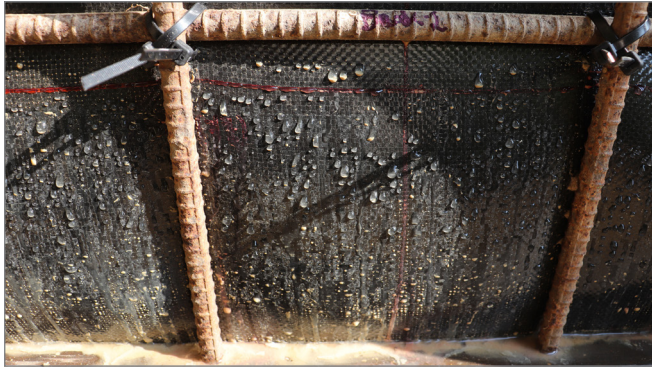
Figure 2. Moisture and air are extracted through the fabric during the ramming course of fabric formwork.